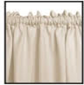
Shirred 1" heading & 1 1/2" pocket