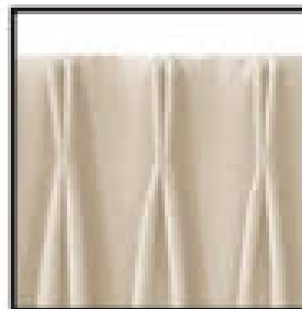
Two Prong Pleat**