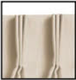
Three Prong Pleat