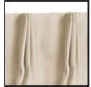
Tacked at Top