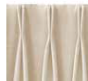
Two Prong Pleat