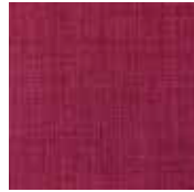
SAINT TROPEZ 48 Colors