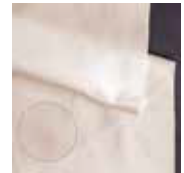
RM DESIGNER SUPER SATEEN Ivory