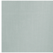
SMART MOVE 81 Colors