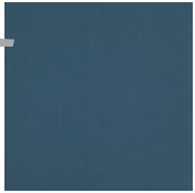
LANDEN 40 Colors

FOUR BEST SELLING FABRICS IN ALL COLORWAYS REPRESENTING 209 SKUS