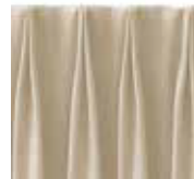
Two Pleat Tacked at Top