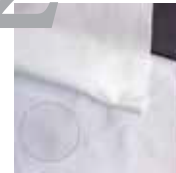
RM DESIGNER SUPER SATEEN White