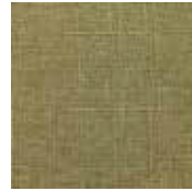
MONTE CARLO 40 Colors