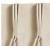
Three Prong Pleat