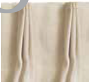
Three Pleat Tacked at Top